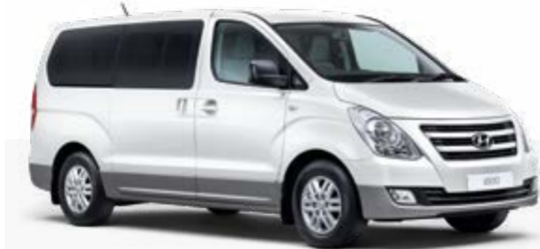
Creamy White - Solid