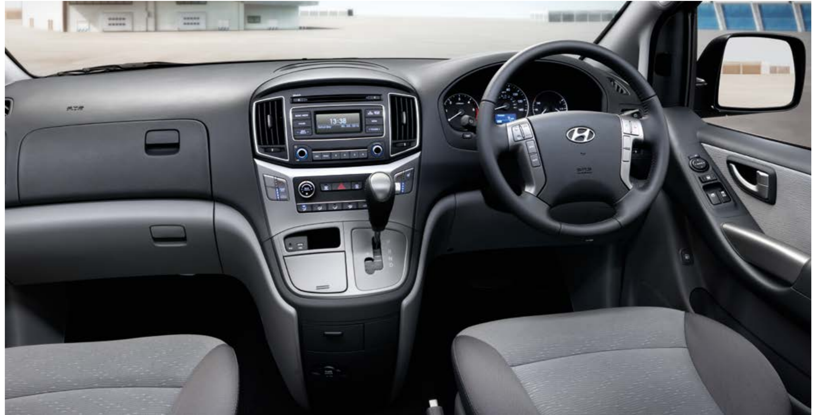
Car shown i800 SE with automatic transmission.

The i800 takes good care of its passengers, but it's just as comfortable in the driver's seat. The elevated driving position gives you excellent visibility, and the seat is also heated and fully adjustable, enabling you to find the right position. The second row slides and reclines, while the third row also reclines. It'll enable your passengers to find the perfect position with generous leg, head and shoulder room. The second row of passengers will also be able to alter the air conditioning settings so they can find the ideal temperature. If there are fewer passengers in the car, you'll still be able to put the space to good use. Both the second and third row of seats split 60/40 for extra storage – perfect for trips to a DIY store or garden centre. With an adaptable layout and the added boost of Bluetooth® connectivity to keep you entertained, it's one of the leading cars in its class.