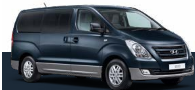
Ocean View - Metallic