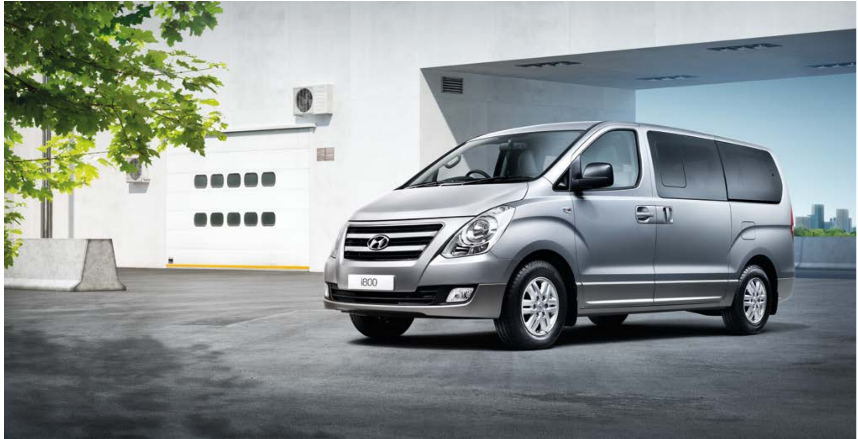
Car shown i800 SE in Hyper Silver metallic paint.

The i800 stands apart due to its smart design – unlike most other cars in its class it comes with eight seats rather than seven, so there's always plenty of room for passengers and luggage. The sliding doors allow easy access for passengers, while useful mud flaps keep the bodywork nice and clean. The 2.5 CRDi engine delivers two power outputs – either 136PS or 170PS – so you'll have all the performance you need. There are also manual and automatic transmission options too. We've incorporated Electronic Stability Programme (ESP), Anti-lock Braking System (ABS), Electronic Brake force Distribution (EBD) and Traction Control System (TCS), so you'll enjoy a safe journey. And when you come to a stop, you'll take advantage of the rear parking sensors to guide you into the tightest gaps. It's a versatile vehicle that's perfect for every occasion.