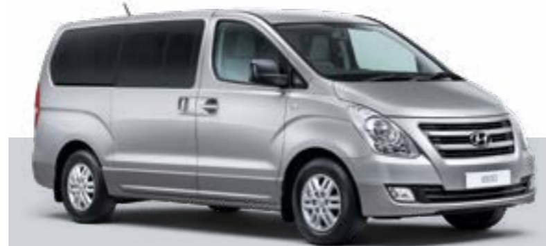
Hyper Silver - Metallic