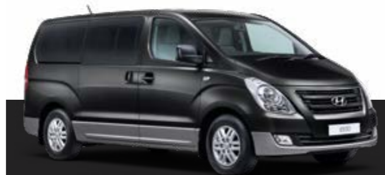
Timeless Black - Pearl